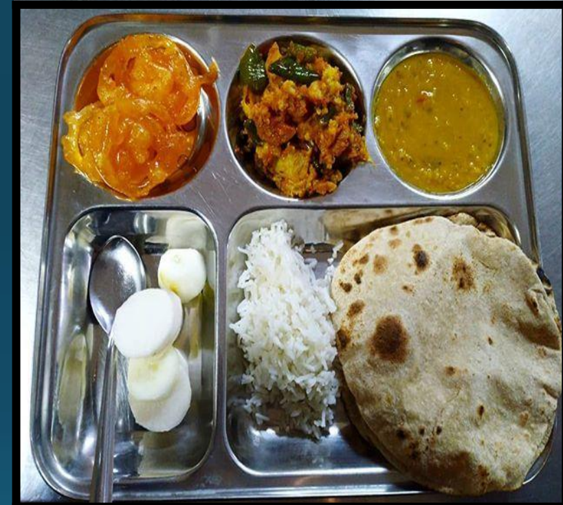
DINNER - INR - 60