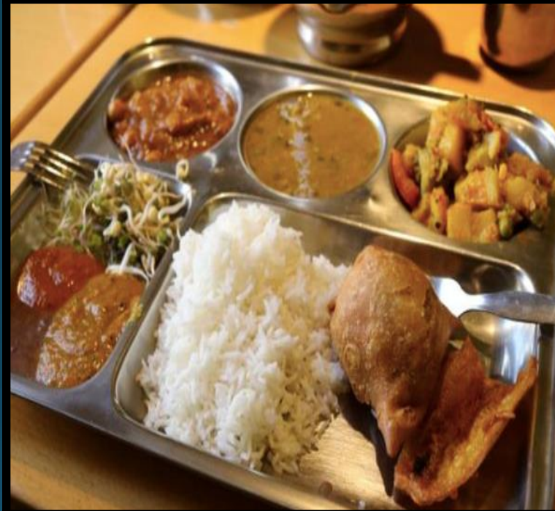
LUNCH - INR - 50