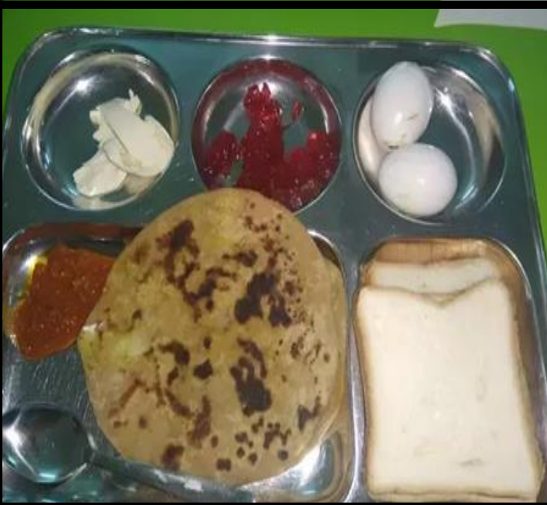
BRAKE FAST - INR- 40